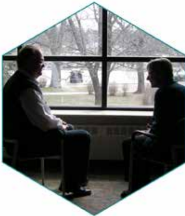
Optional Spiritual Direction

The Benedictine Peace Center at Sacred Heart Monastery provides silent space for prayer and reflection. Experienced spiritual directors are available to accompany retreatants if desired. Located on the bluffs overlooking the Missouri River, the grounds offer a wealth of flower gardens, orchards, contemplative walking paths and the monastery cemetery. Retreatants are welcome to join the monastic community for Liturgy of the Hours and Eucharist.