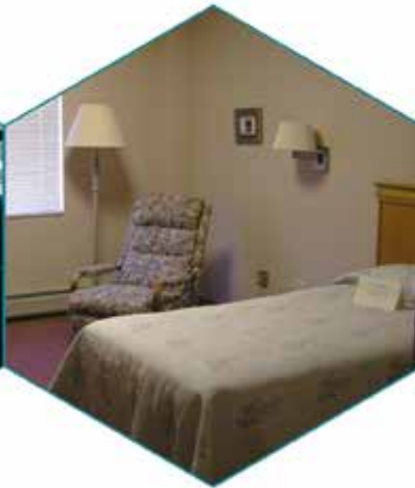
Accommodations in the Retreat Center