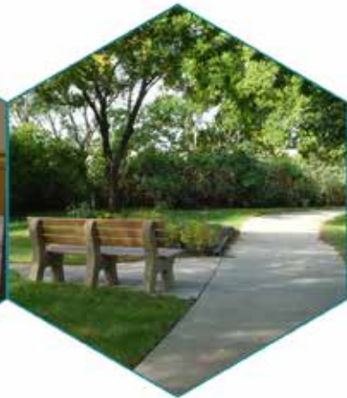
Flexible Schedule For Individuals

Contact us to schedule dates for your personal retreat Your Retreat might be a day, a week, a month.