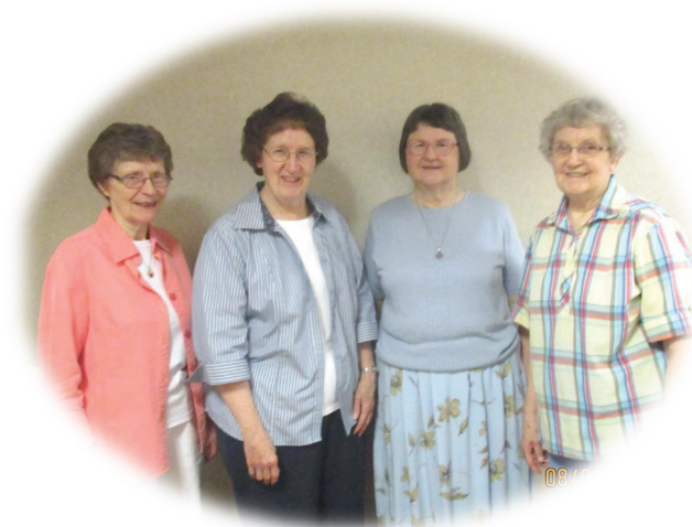
Benedictine Peace Center Staff

An offering of $375 for the year is due by Sept. 1.